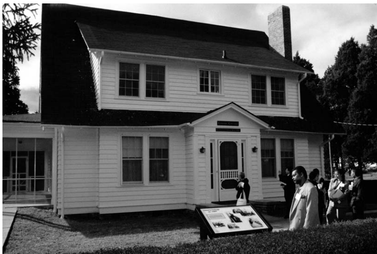
The Charlotte Hawkins Brown Museum at Historic Palmer Memorial Institute, formerly known as the Charlotte Hawkins Brown Memorial, will commemorate the centennial of the institute throughout 2002. As part of a number of special events, Canary Cottage, Dr. Brown's residence on the former Palmer campus, has been extensively refurbished and equipped with 1930s-period furnishings, appliances, and decor to reflect the taste and personality of its former occupant.